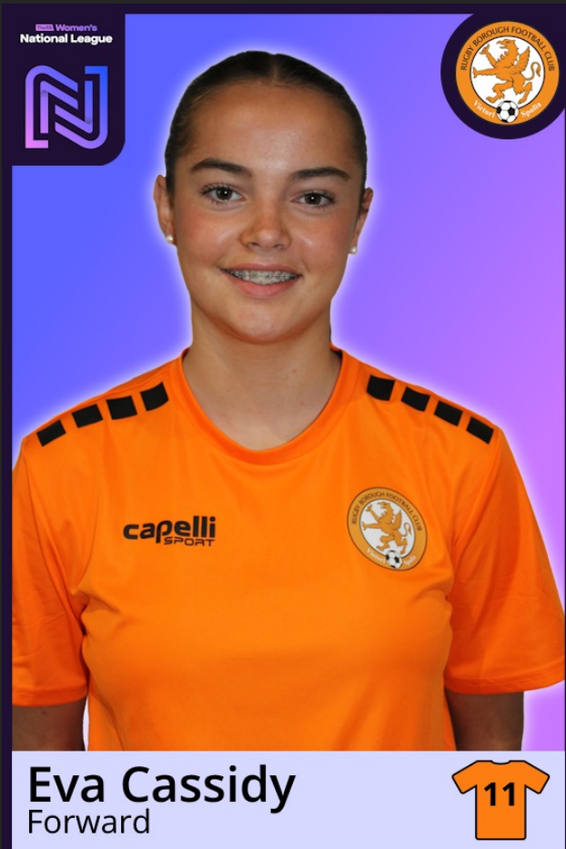
Eva Cassidy Forward