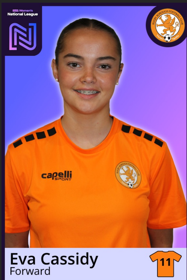
Eva Cassidy Forward