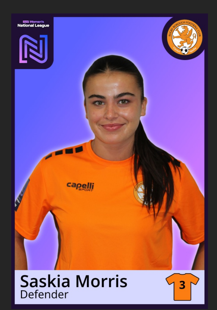
Home Away Terjon Scaffold Dementia UK LTD