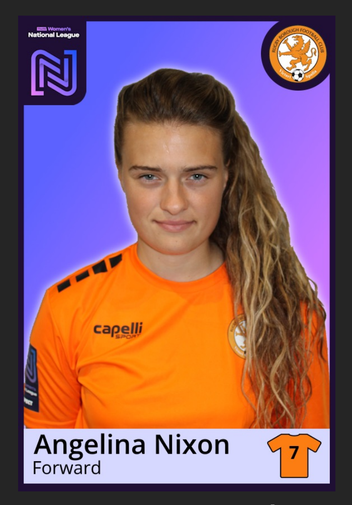
Home Away Rugby Borough Leopards Under 9's