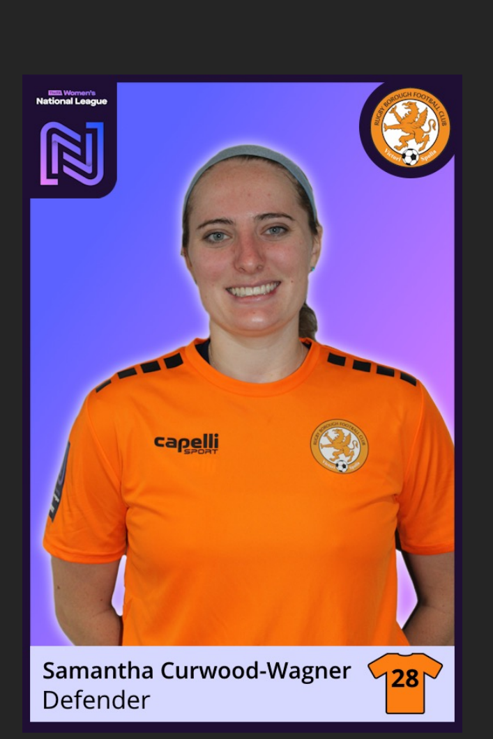
Home Away Sharq Solutions