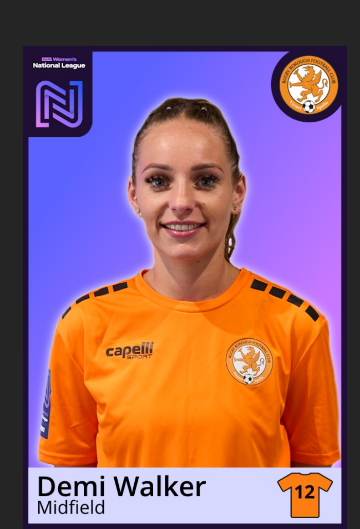
Home Away CSKNN