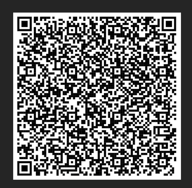
Scan the QR to donate to our page